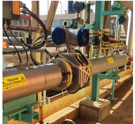
Custody transfer flow measurement with the ALTOSONIC V12 ultrasonic gas flowmeter

The 12-beam measuring device features a vertical diagnostic path that detects contamination on the bottom of the measuring tube. KROHNE also offered to commission the system and train personnel in the use of the two measuring devices. The system had to feature integrated pressure and temperature sensors for custody transfer measurements. KROHNE prepared the documents for custody transfer including calibration certificates, MID certificates, technical documentation etc.